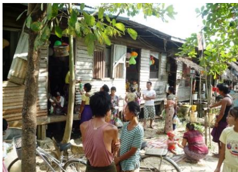
Dala Nursery School

For the first time for years, we were allowed to visit the Nursery School in Dala , across the river from Yangon Downtown. After Cyclone Nargis (2008), the township authorities had prohibited us from visiting the nursery, which we had supported the prior years. This year, the authorities did not object PIN to attend the Christmas Party in one of poorest neighborhoods of Yangon.