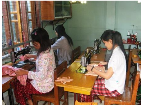
Sewing and handicraft training has started