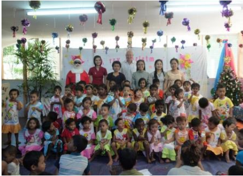
Christmas Party 2014

Just as in prior years, we hosted a Christmas Party for the nursery children, their parents and siblings. All children enjoyed singing, dancing, presents, and free food and drinks.