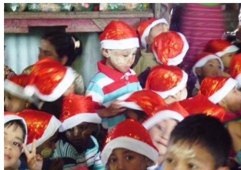
Santa Claus in Myanmar