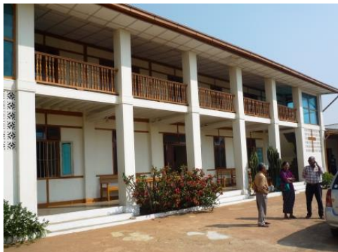
Grace Haven Orphanage

In Pyin Oo Lwin, a Lisu pastor and her husband run an orphanage for 80 boys and girls of different religions. The orphanage is largely dependent on their own rice and vegetable farming and pig-breeding. When the orphanage faced a severe water problem, PIN helped to find financing for the improvement of the water supply and an upgrade of the agricultural land.