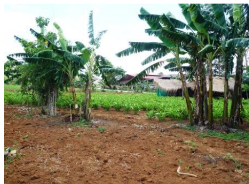
Farm land of the Orphanage