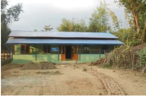
Nursery School in Kanyinthonesint