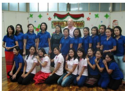
Christmas Party Class#9