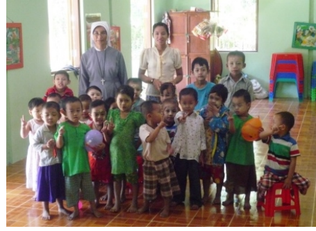
Nursery school children