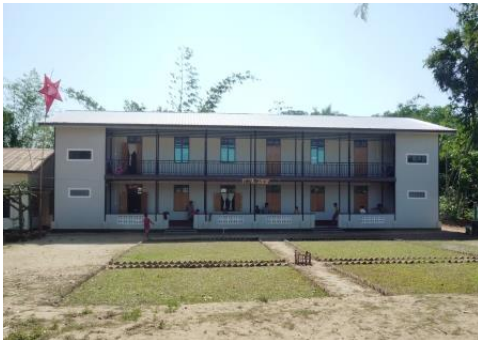
The new building of St. Bruno

To secure the future food supply, the boys also started poultry farming with 500 donated chicken and intensified the gardening and pig-breeding.