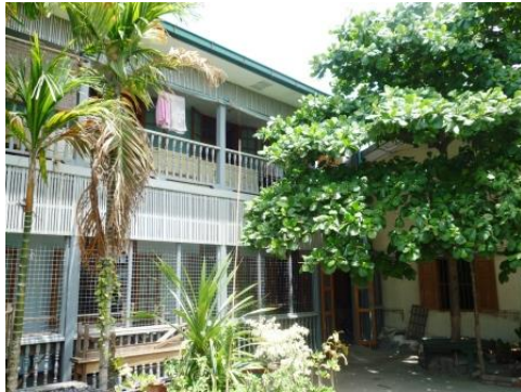
Boarding house in Mandalay Myothit

Center. The construction of the four-storey building in Mandalay Myothit will start in March 2015.