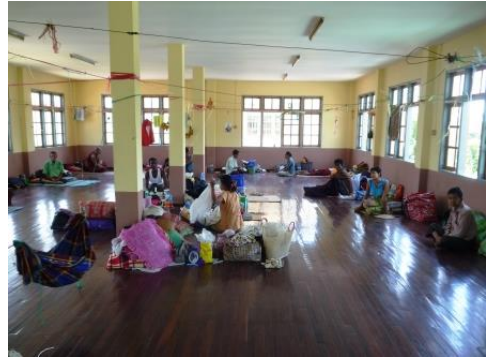
The dormitory after renovation