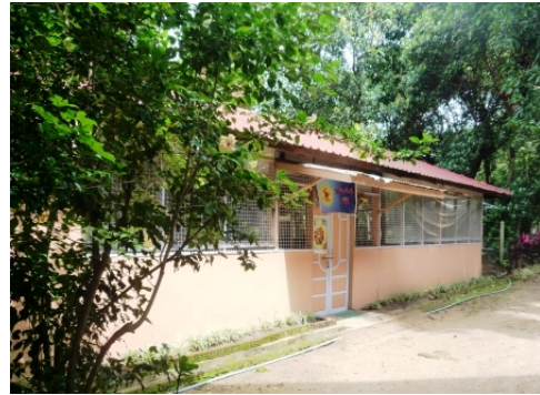
Our nursery school in Yangon