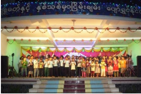
Boys and girls crowd the stage