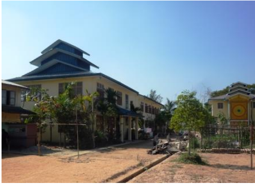
Buddhist Ye Lai Monastery