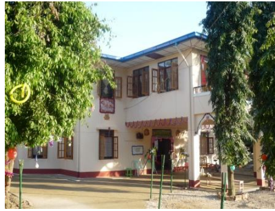
St. Mary Orphanage (Portico)