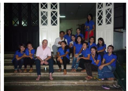
Casual get-together Class#9