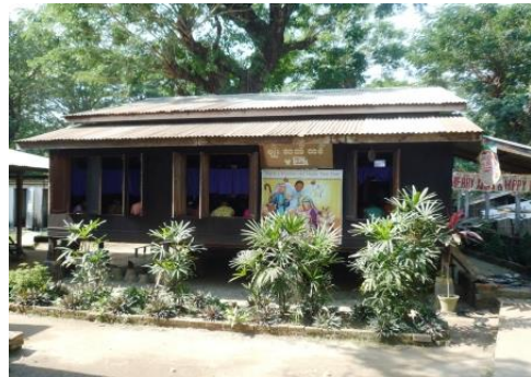
Nursery school at Magyikwin

For the first time for years, we were allowed to visit the Nursery School in Dala , across the river from Yangon Downtown. After Cyclone Nargis (2008), the township authorities had prohibited us from visiting the nursery, which we had supported the prior years. This year, the authorities did not object PIN to attend the Christmas Party in one of poorest neighborhoods of Yangon.