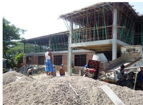
Vocational Training Center in Hlaing Thayar