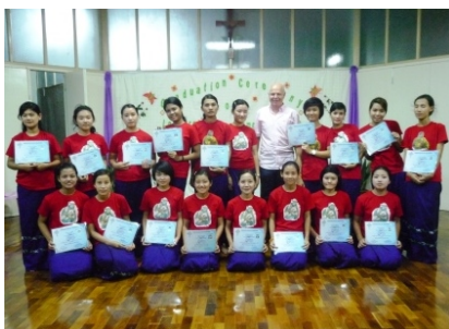
Graduation Ceremony Class#8

In August 2014, 19 girls of Class #8 returned to their home villages, where they will engage in social work.