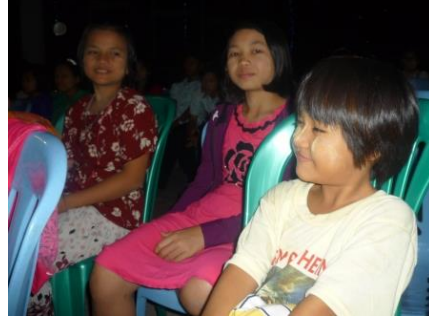
The kids enjoy the party

In Magyikwin , a small village about 3 hours north of Yangon, we hosted the Christmas Party at the nursery school with 50 children.