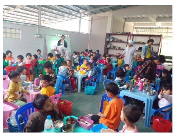
Lunch at the Preschool