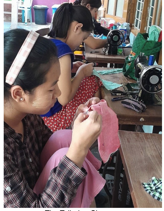
The High-School Class