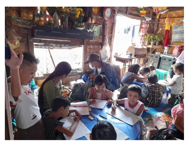
Children at class ...

In 2022 the Good Shepherd Sisters with the help of People In Need and "Wir Machen Schule", continued the informal education program in the four largest slums of Mandalay. After all schools in Mandalay were closed in 2021 and 2022 due to Covid-19 and the military coup, the Good Shepherd Sisters initiated an informal education program together with parents, teachers and community leaders. About 110 slum children are taught by 10 teachers in private homes in four slums; other than schooling the children receive a daily lunch and basic medical care. The daily lunch is cooked in a central kitchen and distributed to the different classes. Thanks to the cooperation with the local communities, the community-based learning program is functioning successfully and largely unhindered by official interferences.