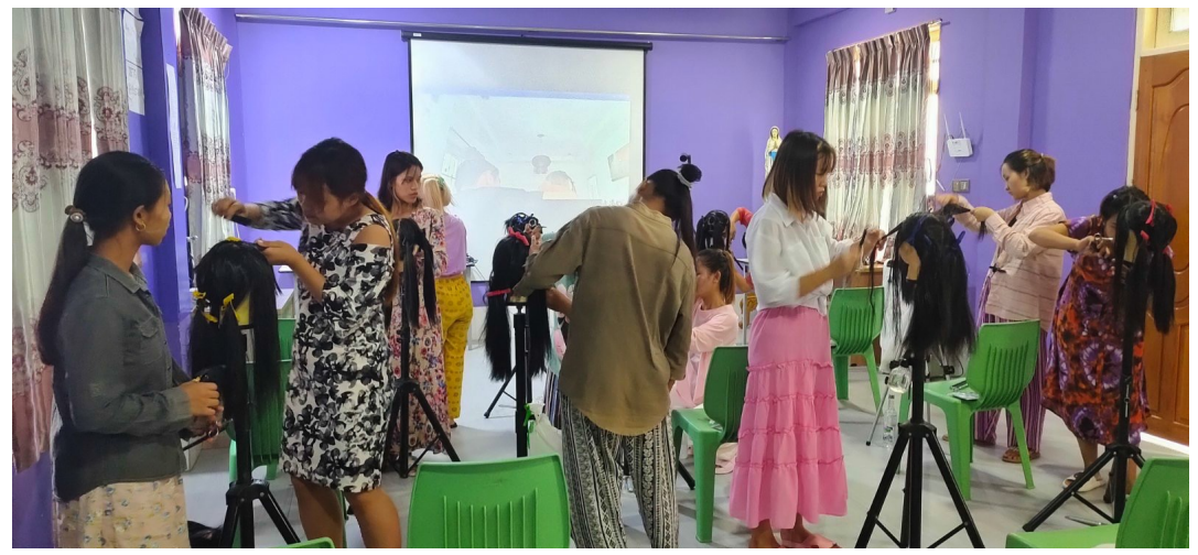
Online Lessons in the Hairdressing Course

Prior to Covid-19, the German company Schwarzkopf had supported the beauty training by sending hairstylists on 2-week volunteer assignments to Mandalay. Unfortunately, after the coup, the security situation did not allow the deployment of international hairdressers to Mandalay. Instead, in 2022 Schwarzkopf Thailand helped the girls with a 2-week online training course.