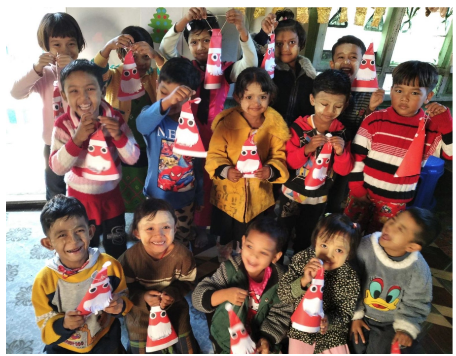
Children in the slum after a psycho-social session