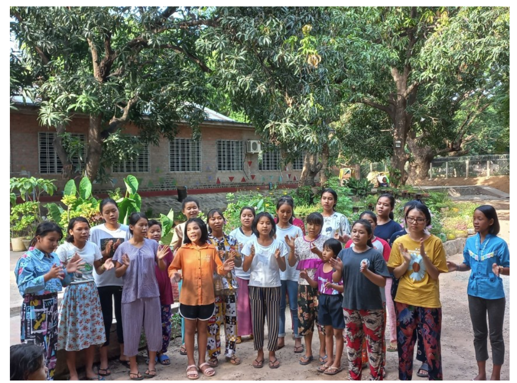
Internally Displaced Persons in Group Training in Myit Nge