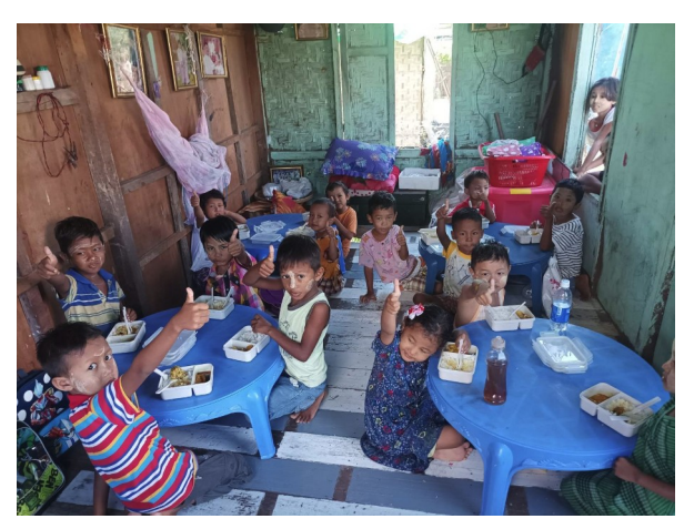
... and at lunch