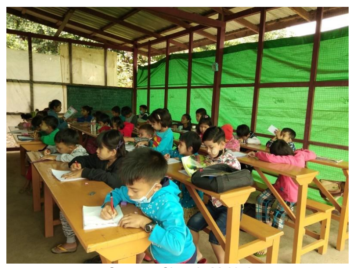
Summer Class in Myitkyina

dormitory. The Sisters spent the donation for 25 underage girls from Chin State who had to flee from fighting and violence.