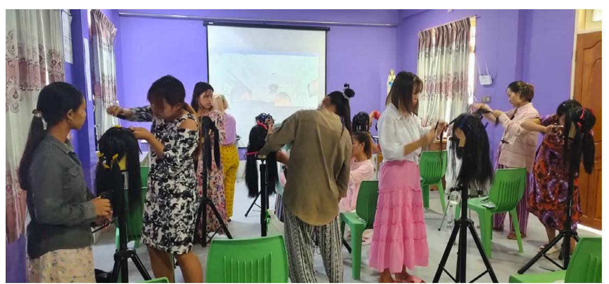
Hair Styling Class in our Training Center in Mandalay

The hairstyling program in Mandalay has been supported by the German company Schwarzkopf for several years. Schwarzkopf supports us by providing local training. In the years before Corona, Schwarzkopf sent volunteer hairdressers to Mandalay for a 2-week hair styling course to teach our students Western hairstyling. Corona and the military coup have prevented the physical dispatch of international hairdressers to Mandalay. Instead, the Schwarzkopf Thailand branch is supporting the girls with a 2-week online course.