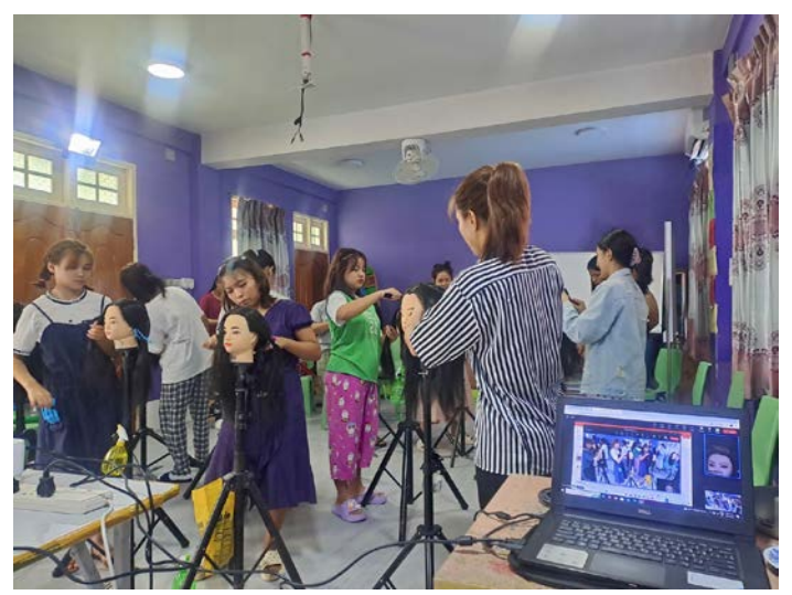
Practical training ... and online lessons: Hair styling