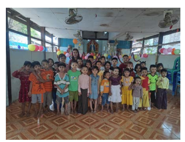
Graduation ceremonies in kindergarten and elementary school