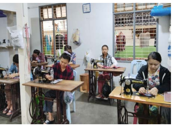
Sewing and tailoring

Like all training courses, the sewing and tailoring class lasts 12 months. After graduation, trainees will start a 6-month advanced program or directly return to their villages.