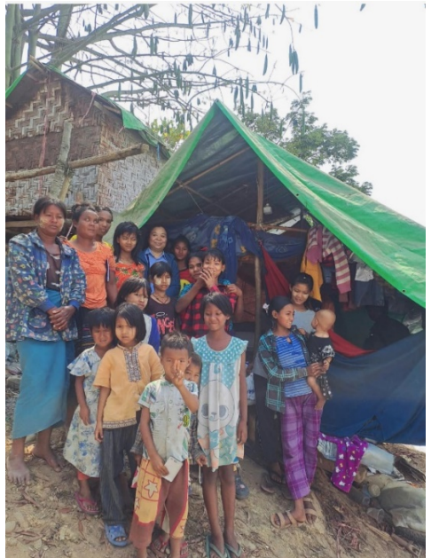
Outreach visits by the sisters to families in and around Myit Nge