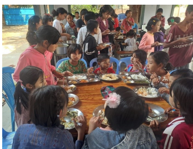
Lunch for All